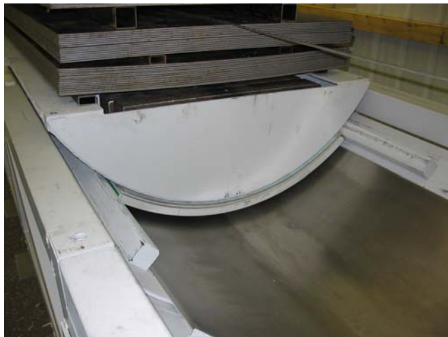
Figure 2: Prototype Test of the Air Cushion Principle Applied to Small Diameter Canister

Notwithstanding the completion of the IDFR reports, this is the Module with the most visible sign of progress as shown in the Figures 2 and 3 below. Bertin Technologies, a French firm, has successfully completed the design, fabrication and testing of a 1/3 scale prototype air cushion device for the emplacement of heavy loads up to 43 tons. Experiences gained here are being incorporated into the design and fabrication of a similar full scale industrial demonstrator to be tested in 2006. ANDRA and SKB worked in close cooperation during the preparation of a list of invited bidders and in the preparation of the tender documents for the industrial demonstrators. Both agencies have now awarded contracts for this work (to 2 separate firms) and Bertin will be a sub-contractor in both cases.