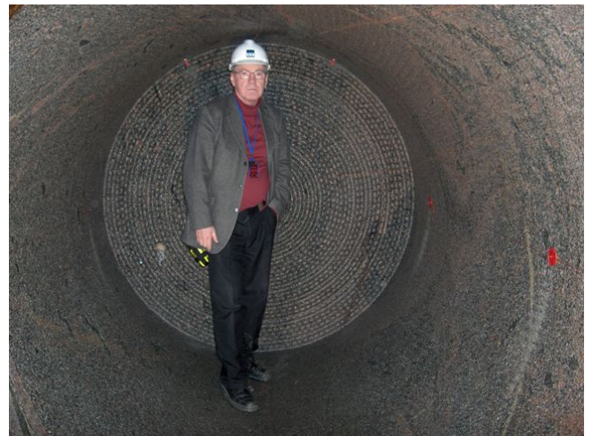
Figure 3: Sealing Plug Construction Site – Full face bored demonstration drift at Äspö